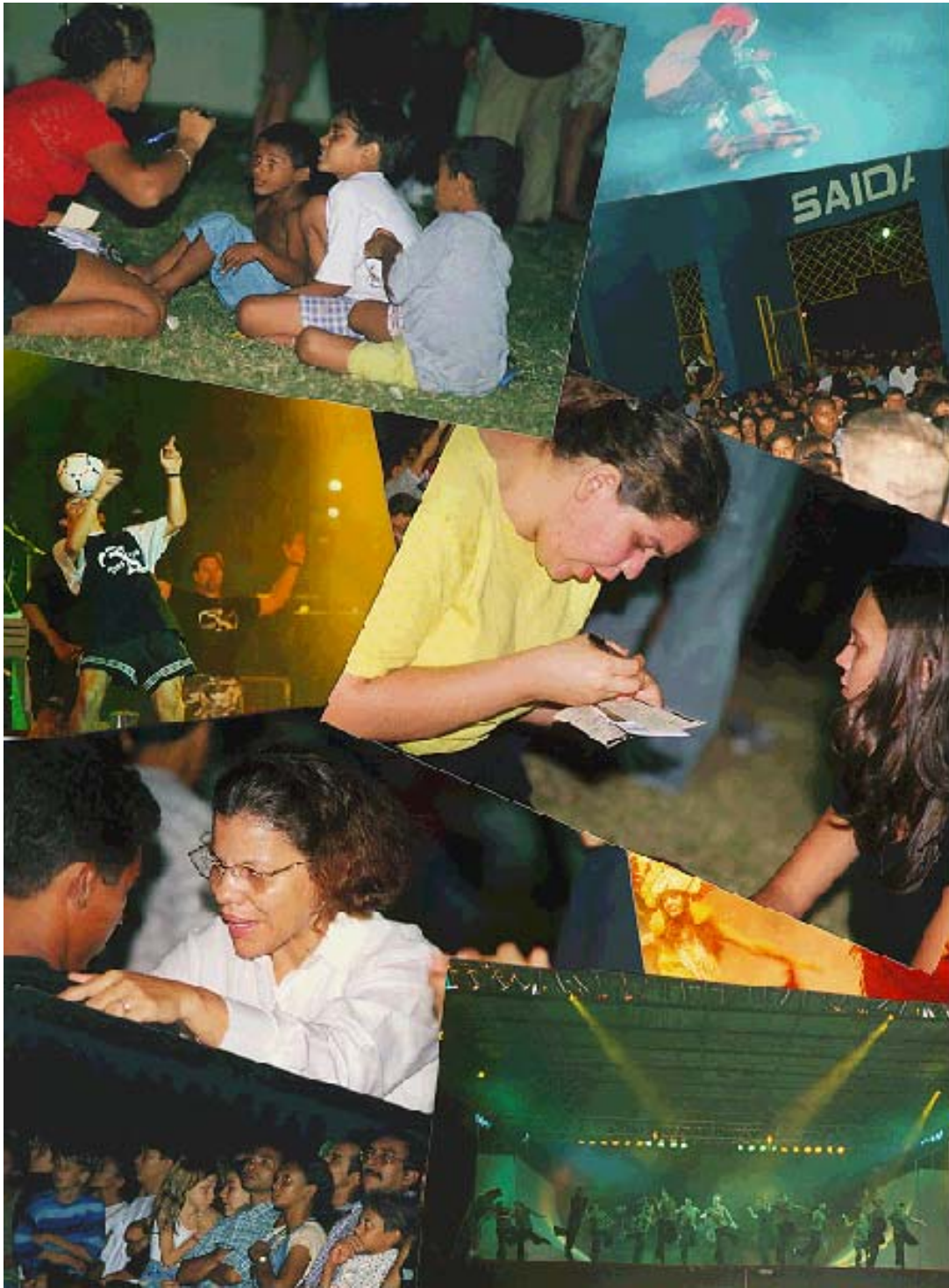
Getting air - Gates open so get out of the way - Getting ready to go on with God - GXJam gives the Gospel thru dance.

Our First "Impact World Tour" campaign in Brazil, the city of Fortaleza (about 2.2 million in population). Over 345,000 in attendance over a 3 week period. Almost half of that number was in the public schools, where at most locations we could openly share the Gospel and give altar calls. Brazil is incredibly