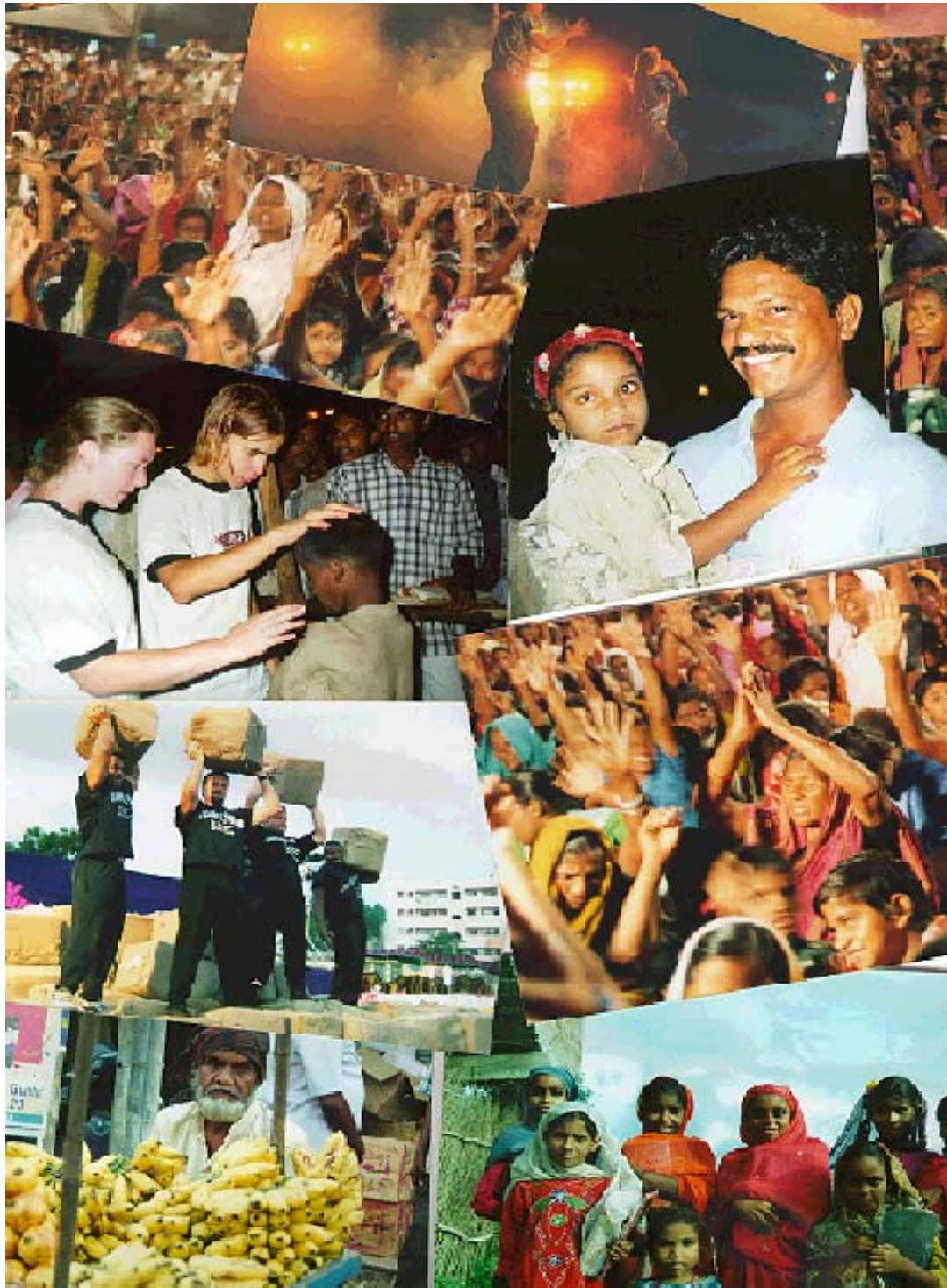
Proud papa showing off his prize - Plenty of people wanting prayer for healing - Pretty young Indians in Punjaris

Our First "Impact India" campaign in Guntur. Over 116,000 in attendance over 6 days and over 15,600 documented decisions for Christ. WE made a difference in the lives of many individuals thru preaching the Gospel to the masses, although I was the only Partner in Ministry who came home with